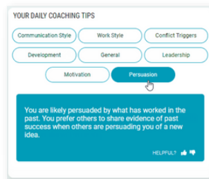
Daily Coaching Tips